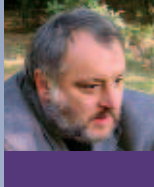
MARTIN ŠULÍK [1962]