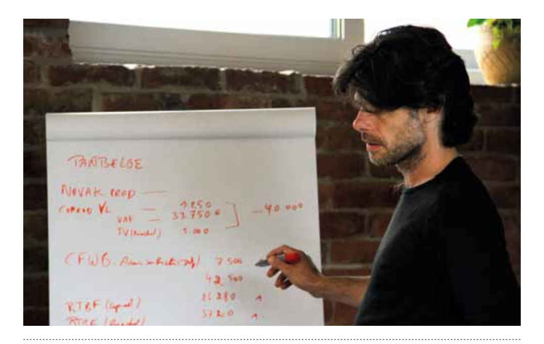
MEDIA TRAINING & NETWORKS 2012