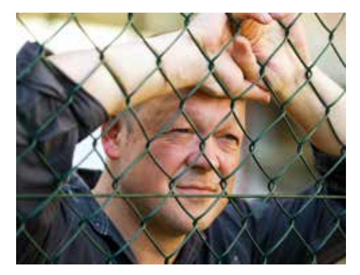
Tango Libre, winner of the Special Orrizonti Jury Prize at the 69^{\rm th} Venice Film Festival

MEDIA supports most major markets and coproduction forums in Europe in order to foster the greatest possible diversity and quality of projects and works, as well as the mobility of professionals. MEDIA also provides an umbrella stand, advisory and logistic services for European professionals at the European Film Market (Berlin), MIPTV, MIPCOM and the Marché du Film at the Festival de Cannes (www.media-stands.eu).