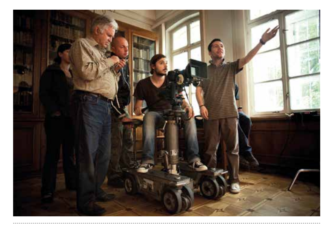
TRAINING & NETWORKS 2013 MEDIA

In 2009, the European Film Academy (EFA) launched the Animated Feature Film Award. In 2013, the EFA Master Class is following up on this by putting a special focus on animated film with a six-day programme consisting of group sessions, screenings, case studies and lectures, and hands-on exercises.