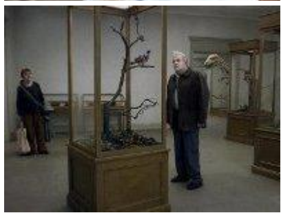
A PIGEON SAT ON A BRANCH REFLECTING ON EXISTENCE EN DUVA SATT PÅ EN GREN OCH FUNDERADE PÅ TILLVARON