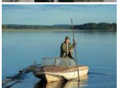
THE POSTMAN'S WHITE NIGHTS

PRODUCED BY: Christophe Rossignon & Philip Boëffard