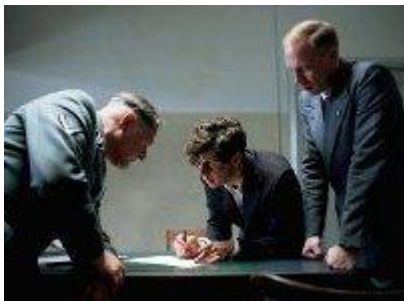
13 MINUTES ELSER