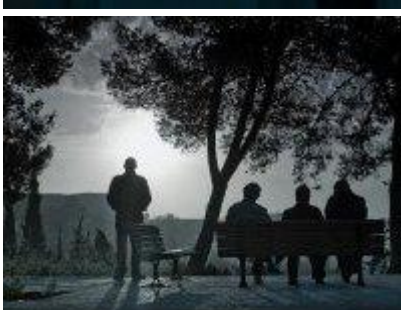
THE FAREWELL PARTY