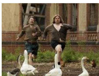
MEN & CHICKEN MÆND & HØNS