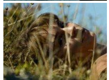
THE HIGH SUN