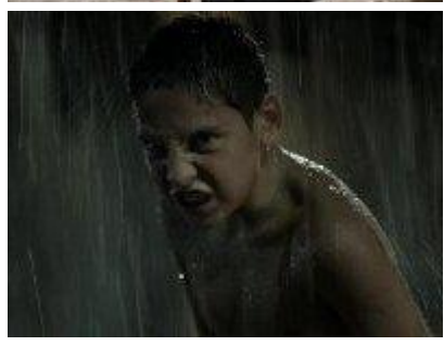
NO ONE'S CHILD

PRODUCED BY: Nanni Moretti & Domenico Procacci