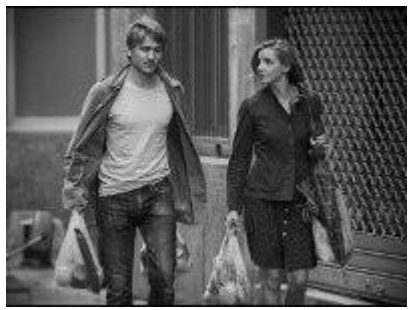
IN THE SHADOW OF WOMEN