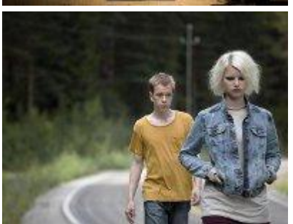
THEY HAVE ESCAPED HE OVAT PAENNEET