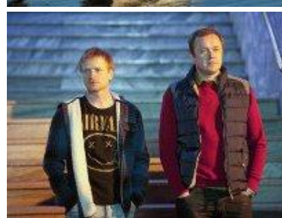
THE SNAKE BROTHERS KOBRY A UŽOVKY