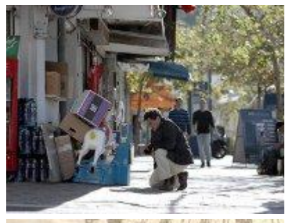
AFTERTHOUGHT HAYORED LEMA'ALA