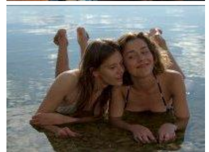
THE SUMMER OF SANGAILE SANGAILES VASARA