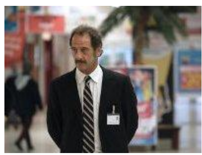
THE MEASURE OF A MAN LA LOI DU MARCHÉ