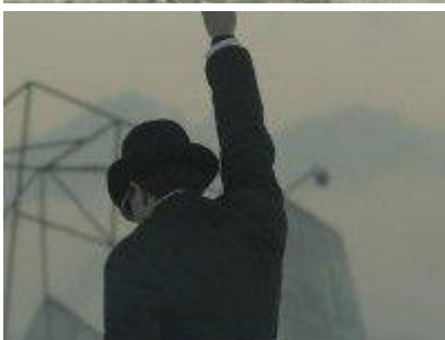
UNDER ELECTRIC CLOUDS