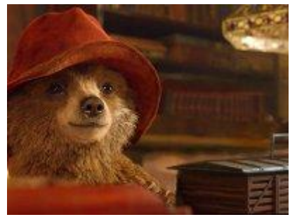
PADDINGTON UK, France, 95 min. WRITTEN & DIRECTED BY: Paul King PRODUCED BY: David Heyman