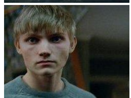
THE HERE AFTER EFTERSKALV / INTRUZ