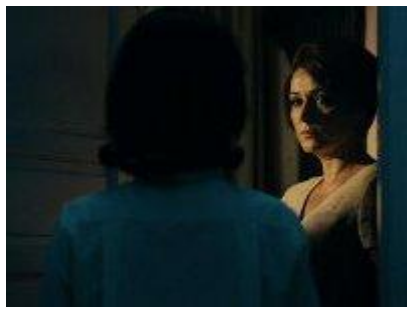
THE DUKE OF BURGUNDY