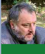
MARTIN ŠULÍK [1962] [SELECTED FILMS]

The Czech State Fund for the Support and Development of Czech Cinematography