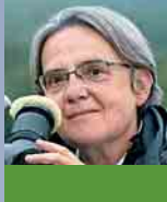
AGNIESZKA HOLLAND [1948] [SELECTED FILMS]