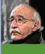
JURAJ HERZ [1934] [SELECTED FILMS]

The Czech State Fund for the Support and Development of Czech Cinematography