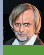
JIŘÍ BARTA [1948]

WITH FINANCIAL SUPPORT OF THE MINISTRY OF CULTURE OF THE SLOVAK REPUBLIC