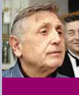
JIŘÍ MENZEL [1938] [SELECTED FILMS]

The Czech State Fund for the Support and Development of Czech Cinematography