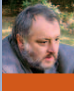
MARTIN ŠULÍK [1962]