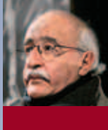
JURAJ HERZ [1934] [SELECTED FILMS]

The Czech State Fund for the Support and Development of Czech Cinematography