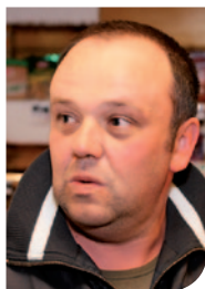
Vladimír Balko director

His feature debut Soul at Peace (2009), internationally premiered at 44 th Karlovy Vary IFF, in the Competition of Feature Films. The film became a box office success in 2009 when it placed as the 5 th most visited film in Slovak cinemas, topping blockbusters such as Avatar or the Twilight Saga: New Moon .